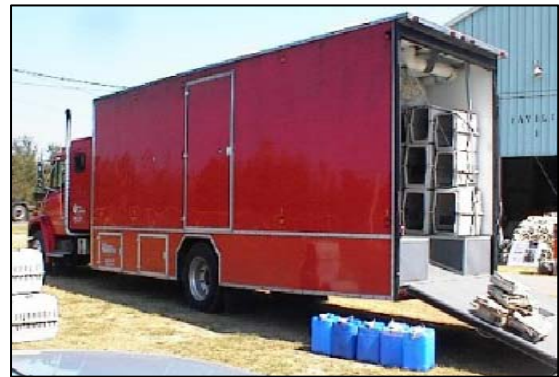
Hillsborough County, Florida's Supply Trailer

Shelter organizers should consider purchasing a trailer to store all the equipment needed for the pet portion of a pet-friendly shelter. Shelter organizers can store the trailer off-site and quickly transport the equipment to the shelter site in the event of an emergency. See the LLIS.gov Practice Note, Shelter Operations: Arlington County's Mobile Emergency Pet Shelter , for information on how Arlington County, Virginia, funded and maintains its pet shelter supply trailer.