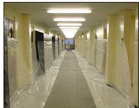
Marion County's Plastic Lining

The animal housing areas should be established in an area that is easy to clean and disinfect. Many jurisdictions require the animal facility to have concrete, tile, or vinyl floors with floor drainage so that the area can be easily cleaned during operations and completely washed down after closing. The Marion County, Florida, Animal Center lines its animal housing area with plastic so that the floor will be protected and will retain its polish after the shelter's closure.