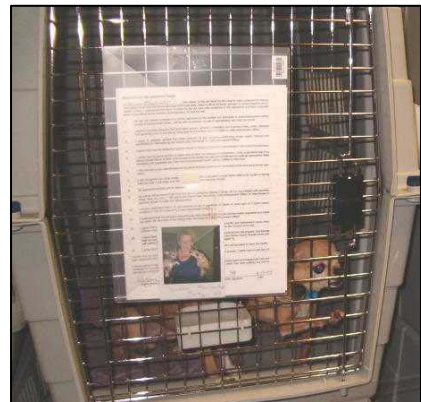
Marion County, Florida's Cage Card

View the Hillsborough County CHAART's animal admission and discharge form .