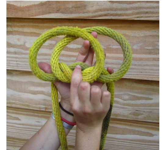
Push folded loop through back of bottom loop and pull through