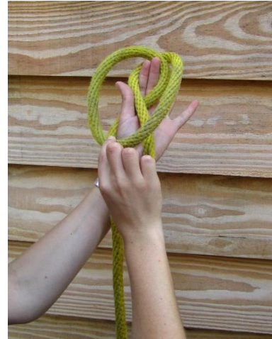
Fold top loop down